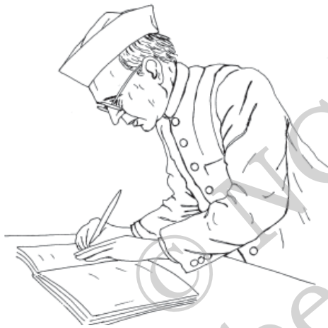
Jawaharlal Nehru CAD, Vol. VI, p. 734

“We did not give him any real power but we have made his position one of authority and dignity. The constitution wants to create neither a real executive nor a mere figurehead, but a head that neither reigns nor governs; it wants to create a great figurehead...”